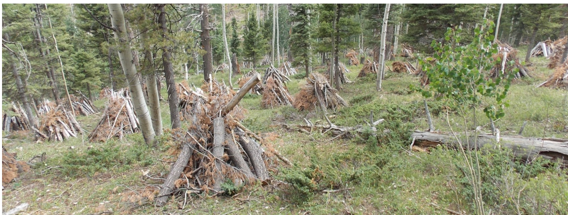
Just one short section

In all we were five and a half hours from start to end including lunch and other small delays. As I said at the beginning of this story 'What a great day to be on the mountain'.